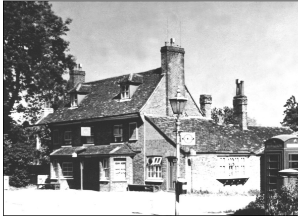
Local Pubs discussed on page 12, from top: The Sun, The Waggoners, The Chequers, The Long and Short Arm