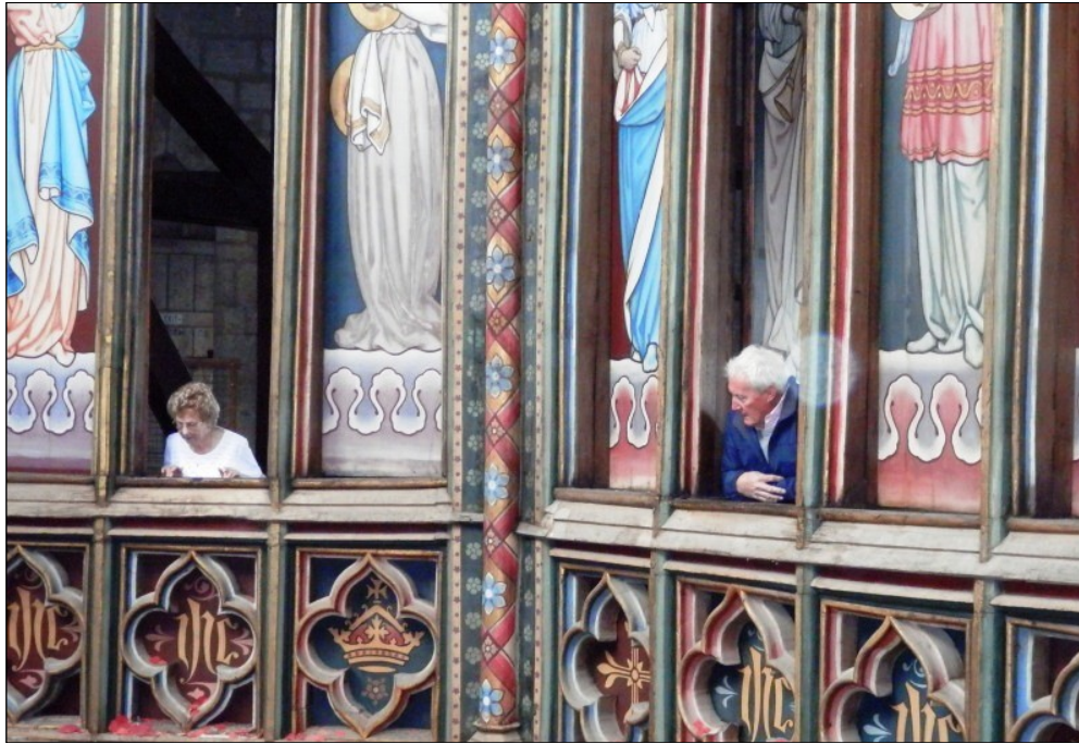
Top :The Lemsford Over 60s Group visited Ely on May 24th, and enjoyed the view from the Cathedral Lantern. Below: At a Service on 11th June we offered up our prayers and thanks.